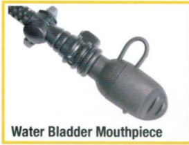
Water Bladder Mouthpiece